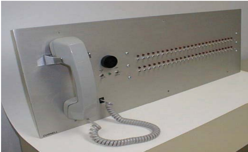
Typical 4500 Annunciator