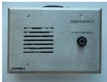
4513 Push Button

The annunciator may be surface, desk, rack, or flush mounted. The telephone handset is mounted on the annunciator panel.