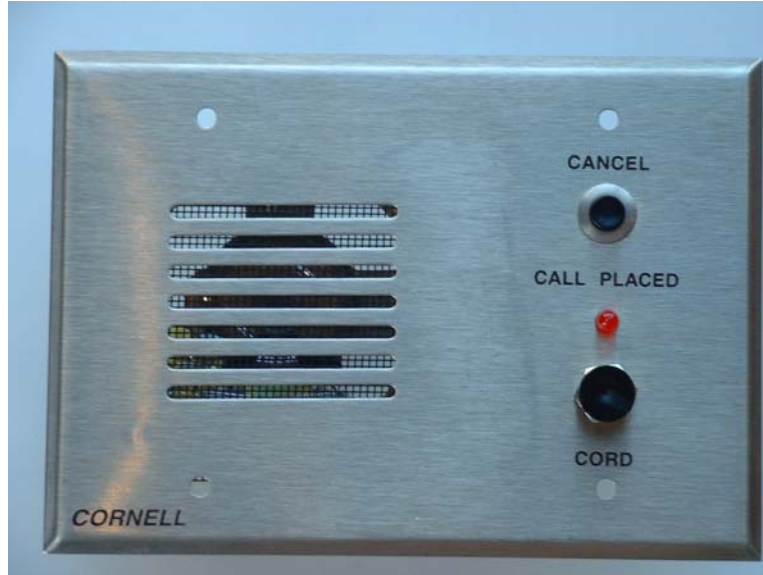
4511 Speaker Station