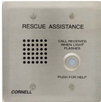
4201B/V Vandal Resistant Call Station with Flush Switch

NEW! Vandal Resistant Stations now Standard