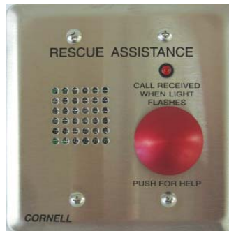
4201B/VM Vandal Resistant Call Station with Mushroom Switch