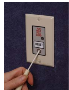
Pull Cord Emergency Station