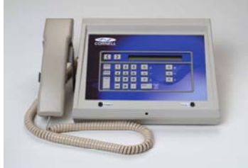
Digital Staff Console