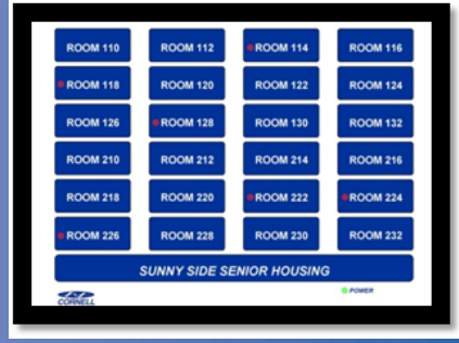
Customized 4448 Series Panel

If you want the flexibility of wireless (i.e. pendants) & wired call stations consider this option.